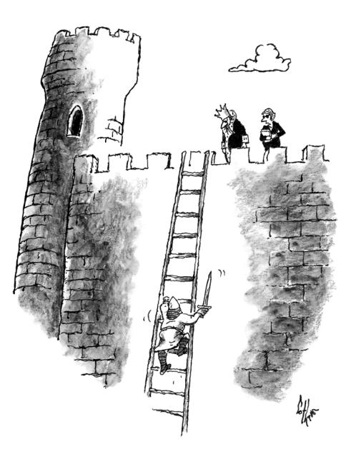
"You're unlikely to find anyplace on the market that is truly impregnable."

The fourth quarter delivered a respite of sorts from the bear market in stocks and bonds. After hitting a new low for the year on October 13th, stocks rallied through the end of November on better-than-feared corporate earnings results and a variety of data indicating that inflation had (finally) peaked. Hopes that cooling inflation would allow the Federal Reserve to slow the pace of rate increases were boosted after the Thanksgiving holiday, when Fed Chair Powell stated that interest rates would only need to rise "somewhat" higher than previous projections.