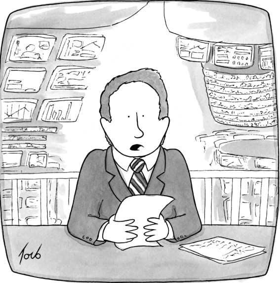
"Markets reacted to the news by edging aside kind of awkwardly and then pretending to take a phone call."

Inflation has shown definitive signs of peaking and declining. The Consumer Price Index has fallen from a high of 9.1% in June to 7.1% in November, while other metrics of inflation have registered similar declines. To be clear, inflation remains much too high relative to the Fed's stated target of 2%. However, continued declines in year-over-year headline inflation data are highly likely, given the fact that we will soon be lapping the very high inflation prints that ensued after Russia's invasion of Ukraine last year. Although the resulting cascade of inflationary pressures from this war has not fully subsided, there has been improvement and some radical changes in European energy policy. The upshot is that the actions taken by EU policymakers in response to the Ukraine war have accelerated energy supply diversification by decades. We see some very interesting investment opportunities globally as a result of this.